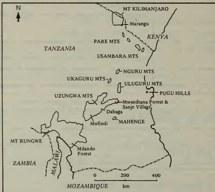
Fig. 1 Forest areas in Tanzania mentioned in the text

The species list for Mwanihana Forest is still incomplete. However, among the more interesting species so far found are a new species of sunbird Nectarinia (Jensen in press), Swynnerton's Forest Robin Swynnertonia swynnertonii (new to East Africa), the Dappled Mountain Robin Modulatrix orostruthus , the White-winged Apalis Apalis chariessa and the Usambara Weaver Ploceus olivaceiceps nicolli . Virtually all the ornithological work so far done has been restricted to the area below 1500 m, so clearly it is possible that much more remains to be discovered here, especially at higher elevations.